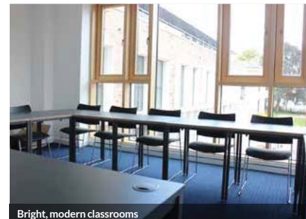
Bright, modern classrooms