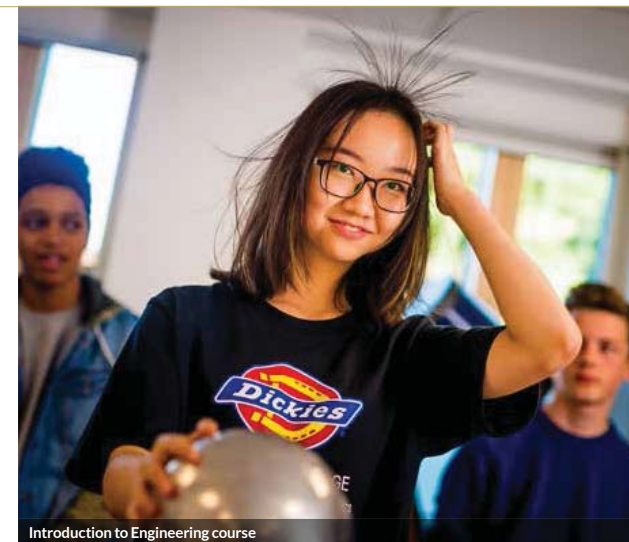
Introduction to Engineering course