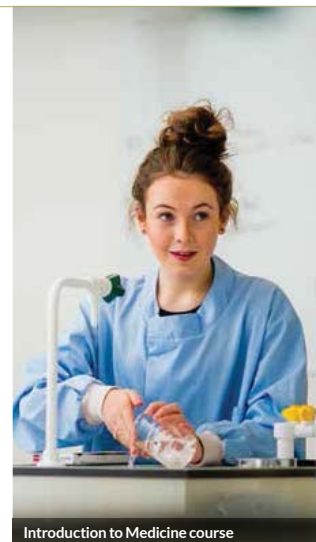
Introduction to Medicine course